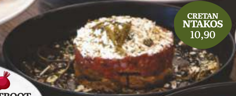
CRETAN NTAKOS 10,90